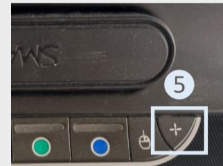
Buttons at the bottom in the centre of the SMART display

During audio playback, make sure that the Smart Display is not muted (2).