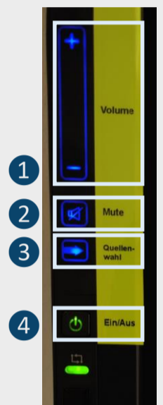
Control buttons on the left side of the SMART display